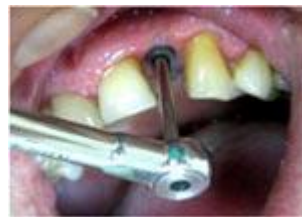
3,4. The sand-blasted abutment is fastened into the implant with a 35Ncm. torque