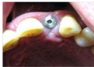
2. Healing cylinder featuring a natural emergency profile from 3.7 to 4.8mm