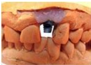
1. Angulated abutment on master cast